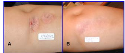
Figure 2. A. Before therapy; female patients, 55 years olds, stable psoriatic plaque on Rt. Elbow. Psoriatic plaque prior to the first treatment. B. Same plaque 5 months after 5 treatments. (Treatment parameters:5 MEDs. Per exposure)